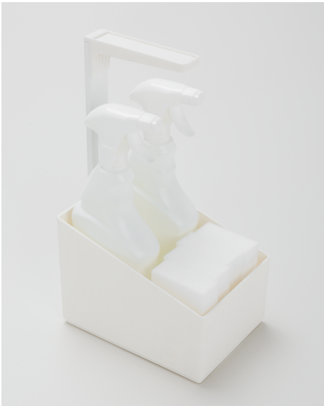
Store your most frequently used cleaning materials in the ToGo box.