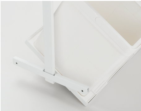
The flip out tray allows for side placement, which is more ergonomic than traditional lean-over drawers.