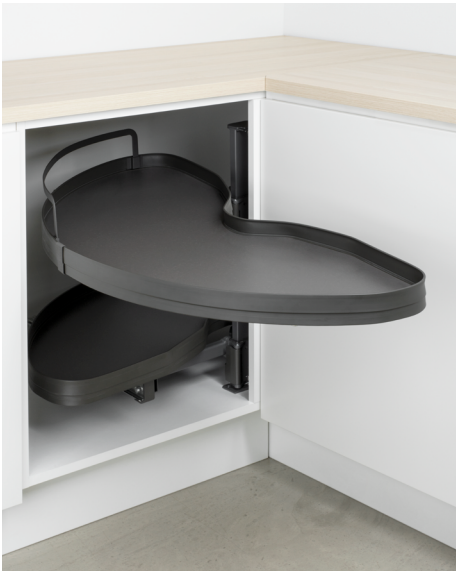
The trays are pulled out in one fluent motion.