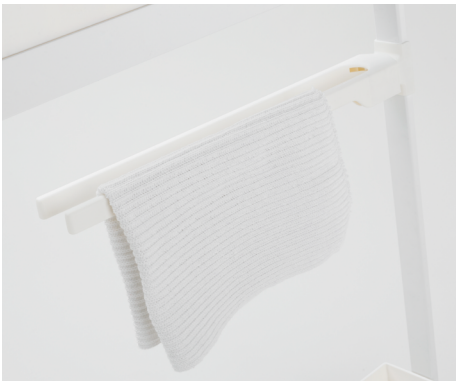
Swiveling towel holder with two racks.

Suited for wash up utensils and dishwasher supplies.