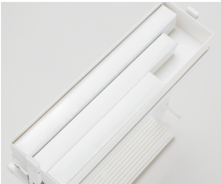
Remove the dividers to make room for larger items.