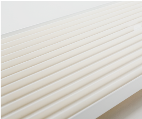
The lower tray is flippable. One side has a fluted surface to keep your cutting boards in place. The other side is flat which makes it suitable for bottles and other household items.