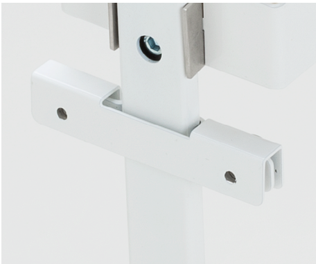
The door brackets can be adjusted in every direction.