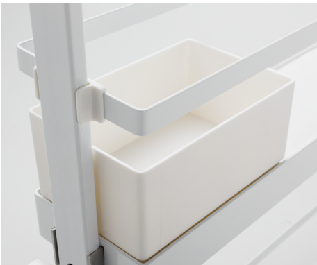
Moveable box for storage of smaller items.