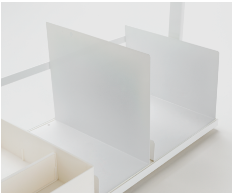
This cabinet is equipped with a pair of bookends.