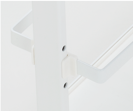
The lower support rail has three different height settings.