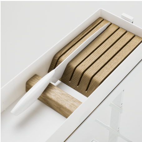
The wooden knife insert keeps your knives protected.