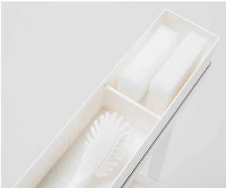
The upper box is equipped with moveable dividers.