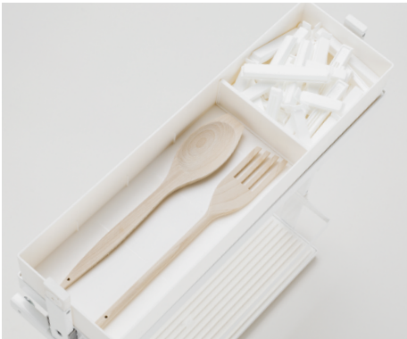
Customize the upper tray to fit your needs with the help of moveable dividers.